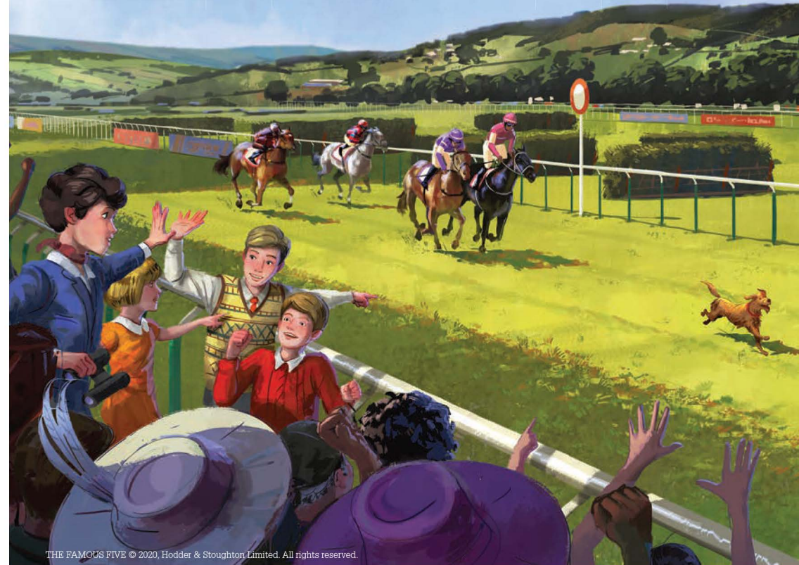
THE FAMOUS FIVE © 2020, Hodder & Stoughton Limited. All rights reserved.